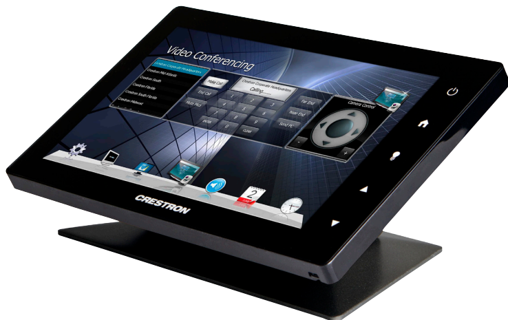
TSW-750-B-S with TSW-750-TTK TableTop Mounting Kit

Customized audio files can be loaded to add another dimension to the touch screen graphics using personalized sounds, button feedback, and voice prompts.