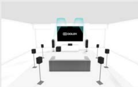
9.1.2 Perspective Detail

This refers to how many overhead or Dolby Atmos enabled speakers you can use in your Dolby Atmos capable setup.