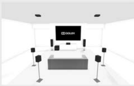
9.1.2 Perspective Detail

This refers to how many overhead or Dolby Atmos enabled speakers you can use in your Dolby Atmos capable setup.