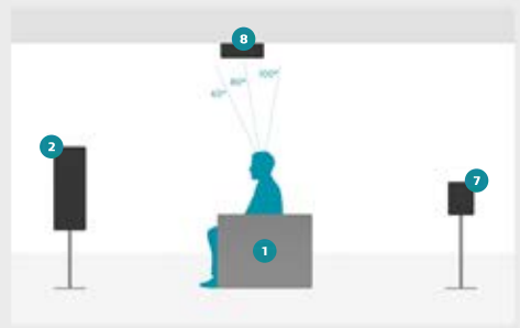
9.1.2 Ceiling Speaker Placement Detail