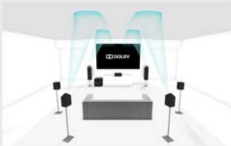
7.1.4 Perspective Detail

This refers to how many overhead or Dolby Atmos enabled speakers you can use in your Dolby Atmos capable setup.