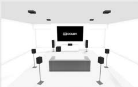
7.1.4 Perspective Detail

This refers to how many overhead or Dolby Atmos enabled speakers you can use in your Dolby Atmos capable setup.