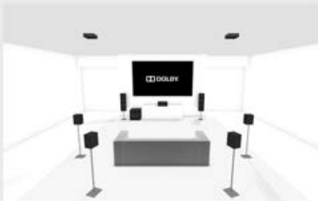
7.1.2 Perspective Detail

This refers to how many overhead or Dolby Atmos enabled speakers you can use in your Dolby Atmos capable setup.