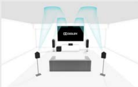
5.1.4 Perspective Detail

This refers to how many overhead or Dolby Atmos enabled speakers you can use in your Dolby Atmos capable setup.