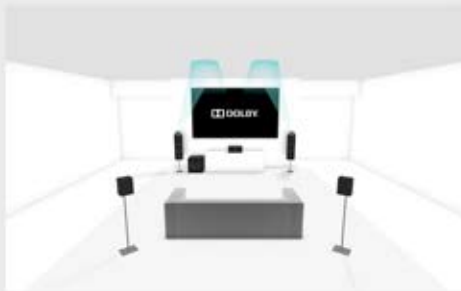
5.1.2 Perspective Detail

This refers to how many overhead or Dolby Atmos enabled speakers you can use in your Dolby Atmos capable setup.