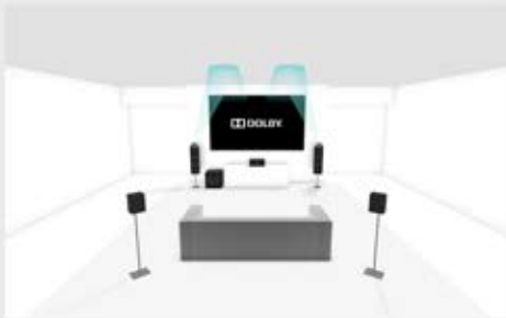
5.1.2 Perspective Detail

This refers to how many overhead or Dolby Atmos enabled speakers you can use in your Dolby Atmos capable setup.