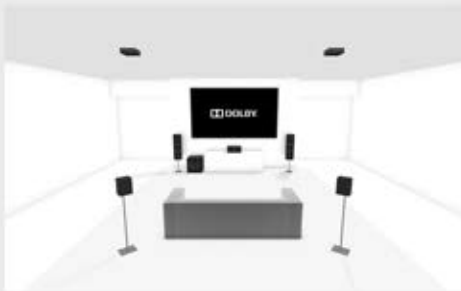
5.1.2 Perspective Detail

This refers to how many overhead or Dolby Atmos enabled speakers you can use in your Dolby Atmos capable setup.